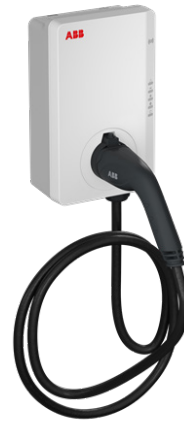
AC charger with connector cable