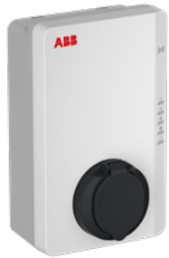
Terra AC charger unit