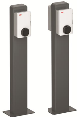
Free standing metal pedestal (single and back-to-back)