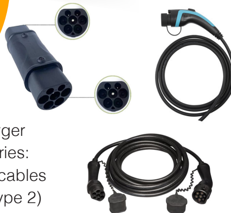
EV Charger accessories: adapter & cables (GB/T & Type 2)